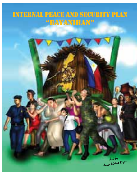
Bayanihan - is this the way to shoulder Philippines challenges?

This volume will illustrate the change of power to a newly elected national administration and reflect on political changes in human rights at the macro as well as the micro-level. In the introductory article,